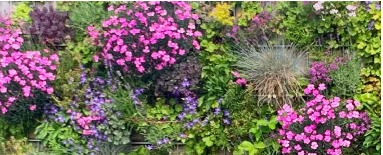
The RANKO Pflanzen-Gabione – the variety of plants leaves nothing to be desired.