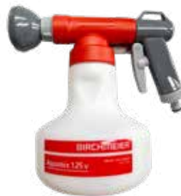
Birchmeier Aquamix fertiliser sprayer