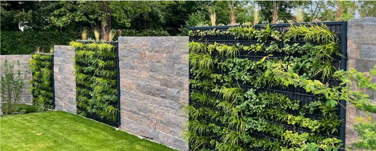
The RANKO Pflanzen-Gabione is available with planting on one or both sides (depth approx. 20 cm or 30 cm).