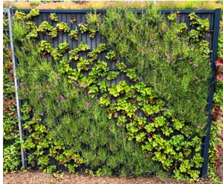
Growth plus: great results after approx. 2 months