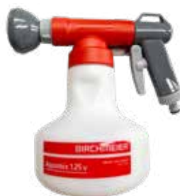
Birchmeier Aquamix fertiliser sprayer