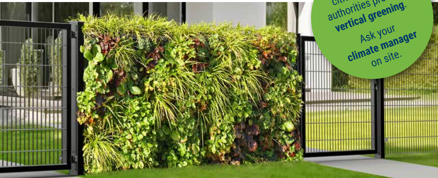
The RANKO Pflanzengabione also cuts a fine figure in any fence course.