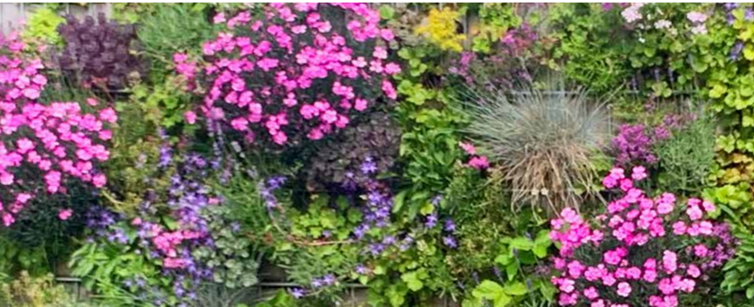
The RANKO Pflanzen-Gabione – the variety of plants leaves nothing to be desired.